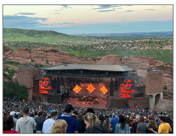
Red Rocks Amphitheater

As a community of faith, consistency of rhythm and habit are essential for growth. We need to see each other in worship or in small groups to be reminded that we are not alone and to be encouraged to live the life that Jesus imagined for us and invited us to live. We need consistent habits of reflection and spiritual reading and giving and serving to center our scattered lives on our core vision at Incarnation of "a world filled with God's grace and love." To create a world filled with God's grace and love we need to be people filled with God's grace and love. Remember, what we focus on and do consistently is what we become ultimately.