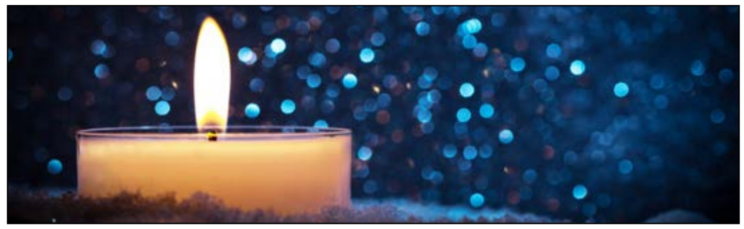
Page 11 incarnationmn.org

This list reflects donations that were made payable to Incarnation Lutheran Church in memory of someone. Memorials are applied to whatever fund the donor designates. If <u>not</u> designated, sometimes the family requests what fund they would like the memorials designated to. Note: If a memorial gift is received and the check <u>isn't</u> written out to Incarnation Lutheran Church, it will be forwarded directly to the organization that the check was made payable to. Those memorials are typically acknowledged by the organization that receives the donation.